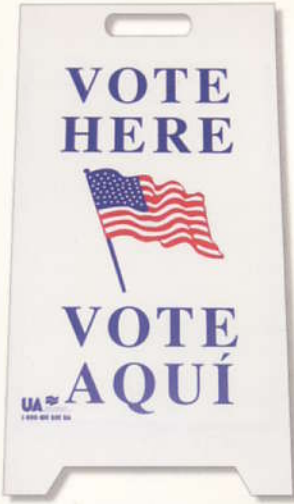
Order No. 0-36 (stand sold separately)