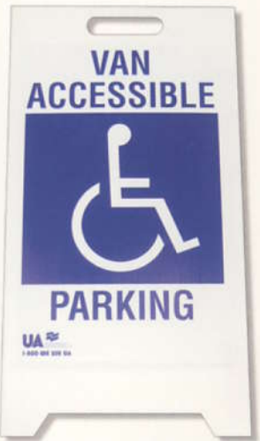
Order No. 0-38 (stand sold separately)