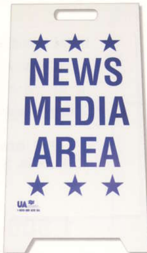
Order No. 0-45 (stand sold separately)