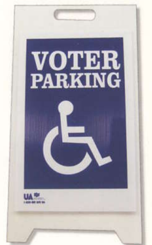
Order No. 0-21 (stand sold separately)