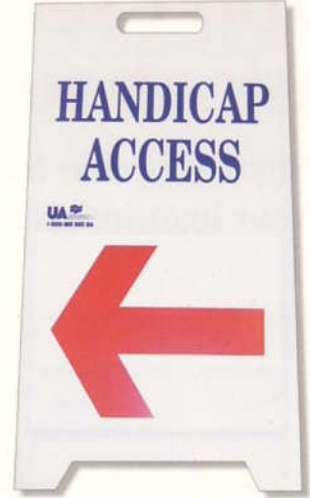
Order No. 0-30/HANDICAP ACCESS 0-23/ARROW - 14" x 11" ea. (stand sold separately)