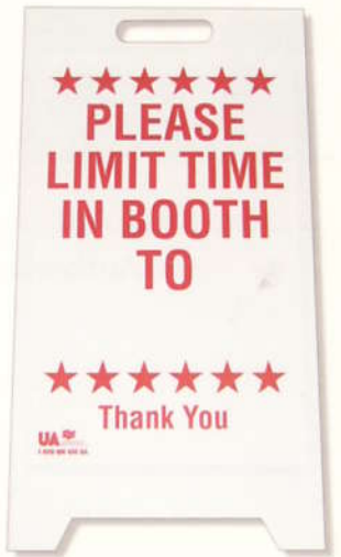
Order No. 0-46 (stand sold separately)