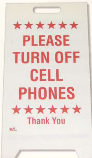
Order No. 0-44 (stand sold separately)