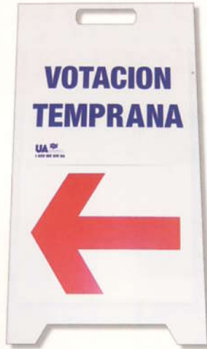
Order No. 0-43/VOTACION TEMPRANA 0-23/ARROW - 14" x 11" ea. (stand sold separately)